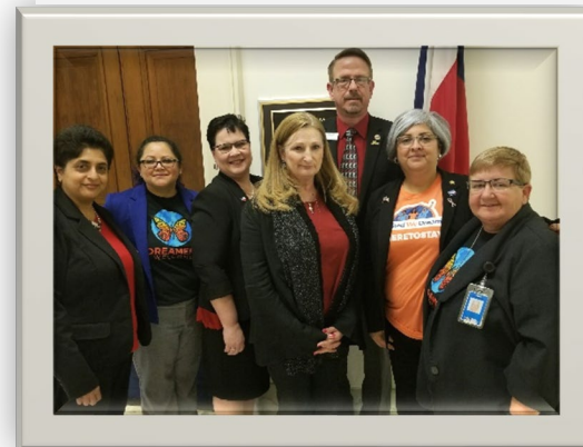
NEA Lobby Day - #TeamTSTA