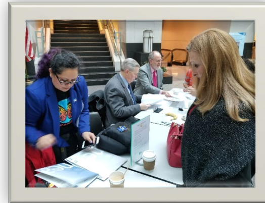
Prepping for our Day on The Hill