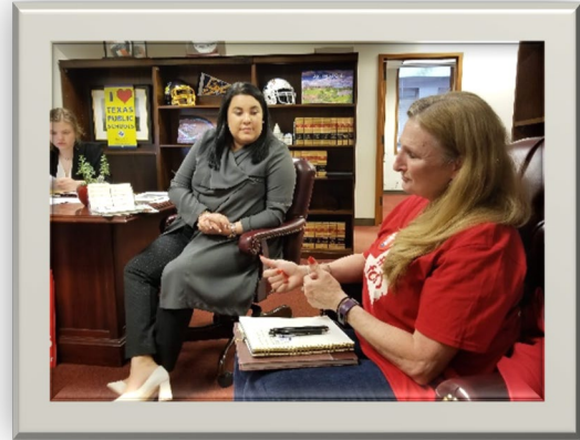
Lobbying our State Representative