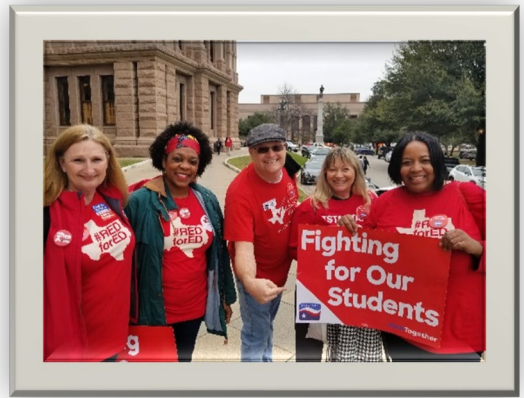
TSTA Lobby Day